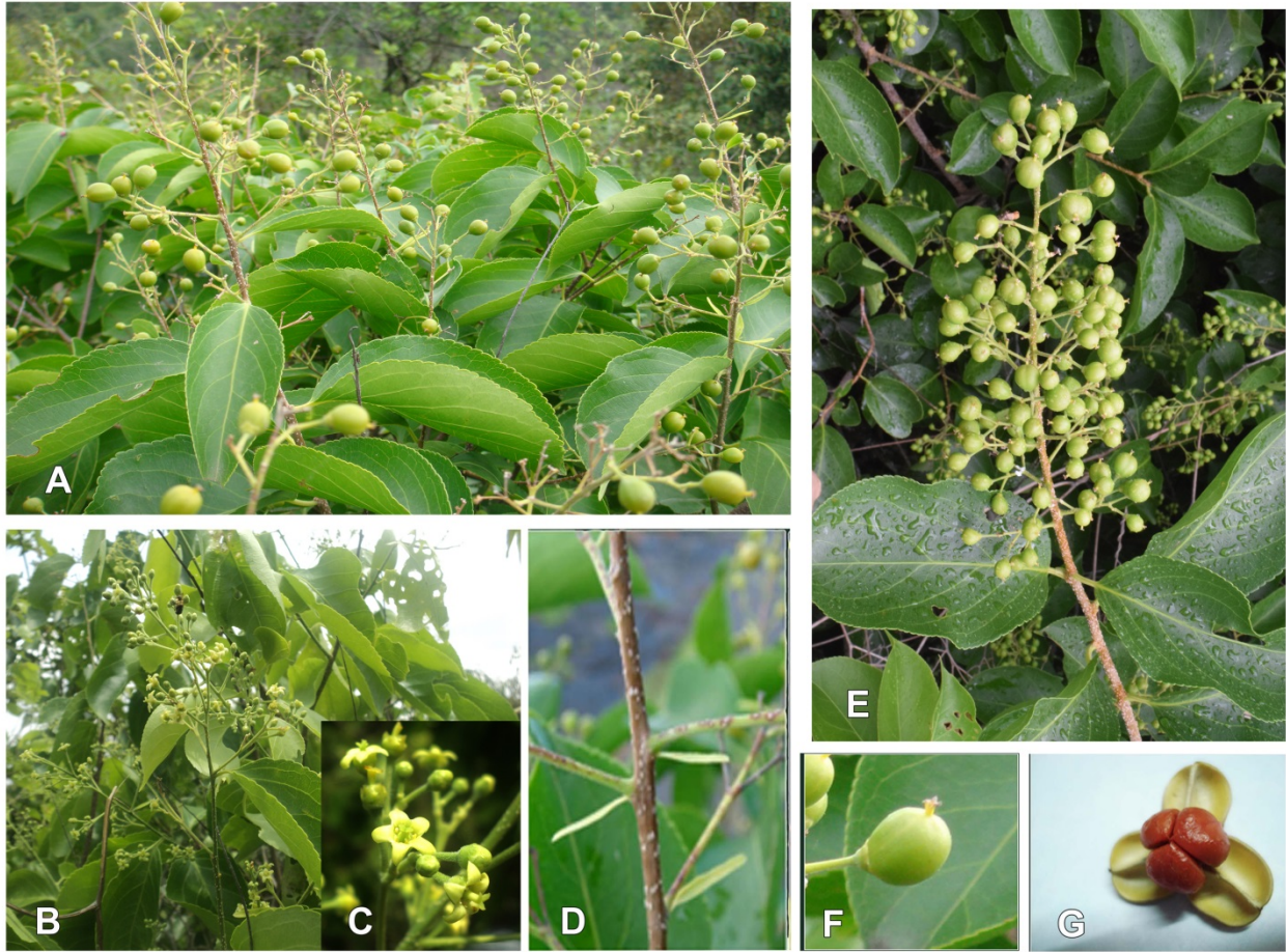
Fig. 2: Celastrus paniculatus Willd. ssp. angladeanus S.J. Britto, B. Mani & S. Thomas. A: The plant habit with young fruits. B: Flowering branchlets. C: Close-up of flowers. D: An Inflorescence with bracts. E: An Infructescence. F: Close-up of a capsule. G: Capsule with seeds.